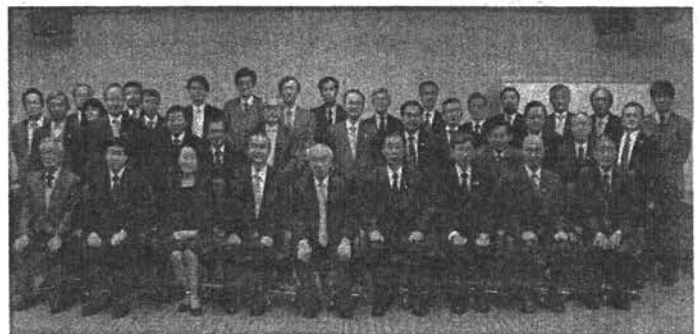
Science Council of Japan and Representatives of 30 Academic Societies, November 29, 2014

In March 2015, Japanese Association for Disaster Medicine held the twenty-anniversary symposium with Academic Society Liaison Association. This was the memorable discussion of medical doctors and scientists. We also welcome a new member of Japan geoscience union. Interdisciplinary collaboration is going to spread steadily.